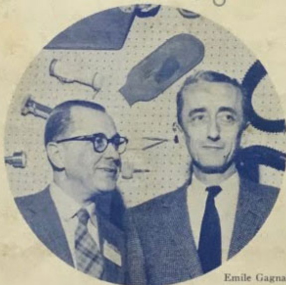
Emile Gagnan and Capt. Jacques Y. Cousteau Co-inventors of the "Aqua-Lung"