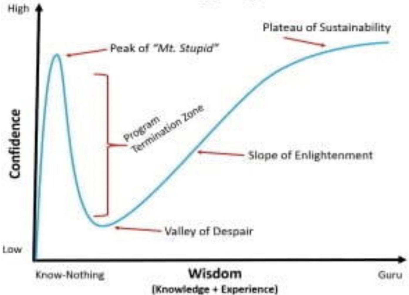
Fig. 1: You have probably seen something like this. It's not an accurate representation of what Dunning and Kruger said.

The memes were so successful that they even found their way into corporate consulting and management training programs. As a result, there are quite a few people with expensive educations who accept them as an accurate illustration of a real-world phenomenon. Many of us will have seen similar memes in the context of diving, at one point or another.